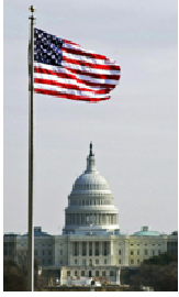
Let Freedom Ring