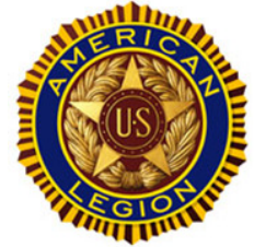
Stenz-Griesell-Smith American Legion Post 449

Four Forty Niner is the official newsletter of Stenz-Griesell-Smith Post 449 3245 N. 124th Street Brookfield, WI 53005 (262)781-0488